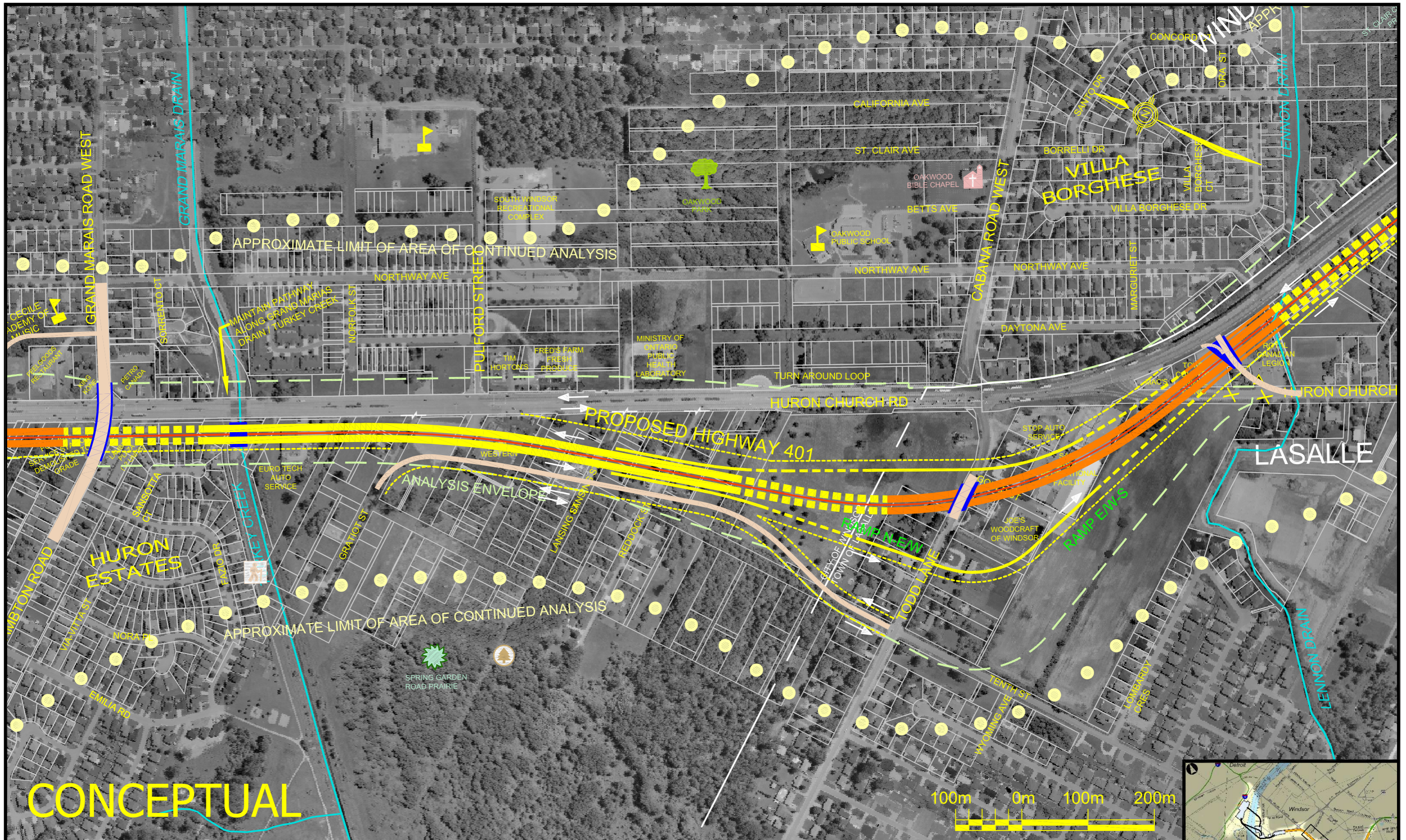
ACCESS ROAD ALTERNATIVE 2A